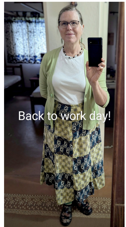
All dressed up for the first day back to work.