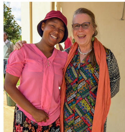
A recent graduate came back to give us an academic update