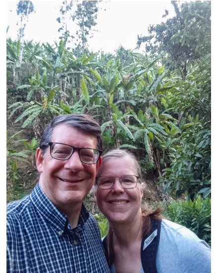
A Fun Day at Arusha National Park