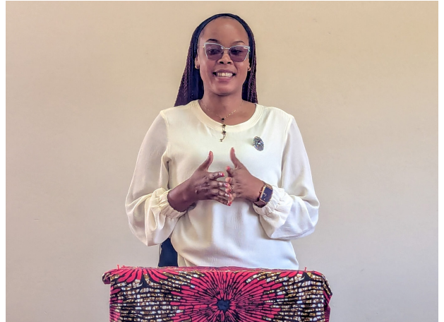
Upendo giving words of wisdom to the RICE graduates.