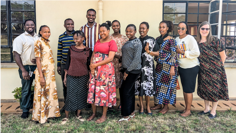
Graduates of the 2025 PGS program and their teachers.

(PGS) Program run by the Rafiki Institute of Classical Education (RICE). This year we had nine students make it through the forty week program. Many of these students spoke English infrequently and read the Bible even less frequently when they arrived last January. Through the program, they were immersed into an English only environment and a daily Bible study in addition to their coursework in classical Christian education philosophy and methods. We had a celebration lunch this past week to mark the end of their time with us. Rafiki gives each of them a Reformation Study Bible and a Rafiki Hymnal to help them continue their growth as Christian educators. Several of them already have teaching positions for the coming school year and we are praying that God will provide positions for all of them soon. We also interviewed nine potential students for next year's class. We hope to interview the rest in January so that we might reach our goal of twenty. Please pray that our church partners would help send qualified candidates to us.