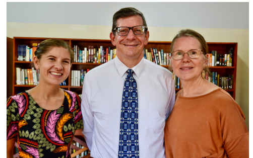
The Rafiki Tanzania missionary team