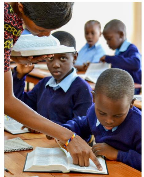
Primary students during Bible study

Since September we have completed Leviticus, Numbers, and Deuteronomy. After Easter break, we will finish the last chapters of Joshua. It has been great to get a big picture view of God's work among His people. It can be challenging to understand all the laws that God gave the Israelites, but we can be assured that all of them are meant to point us to His holiness and the need for salvation through His son. We can also learn that God disciplines His people when they rebel but ultimately, He shows His great grace and love through many miracles done on behalf of His people. Likewise, believers today may falter but He has provided such an amazing gift of love through the sacrifice of Jesus on our behalf! Our obedience to God is never to earn His favor but a way of showing our love and thankfulness to Him.