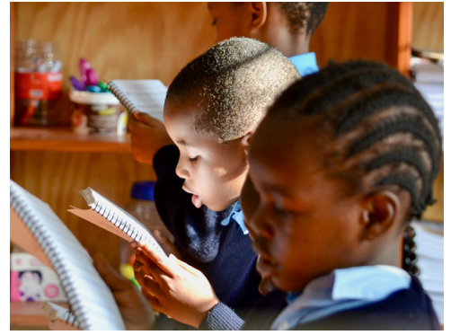
Another class of primary students during Bible study