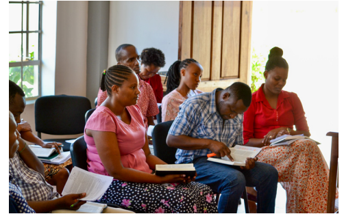
RICE students studying God's Word