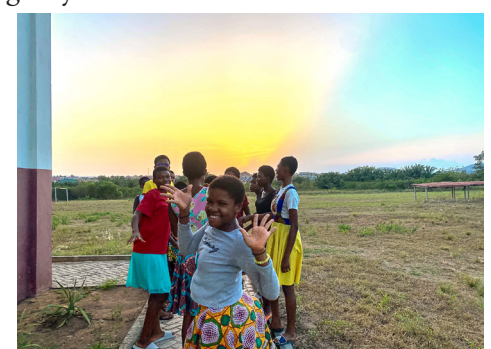
Ghana girls. May God bless them; may they love Him!