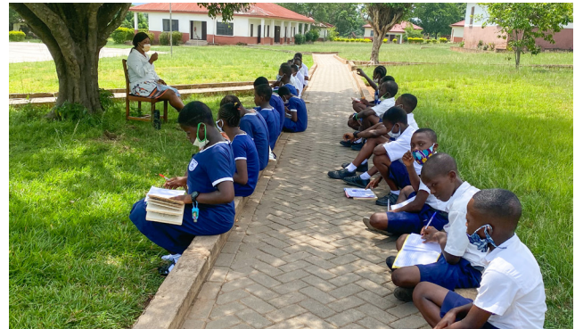
The grade four class enjoying the fresh air and a good book with their teacher.