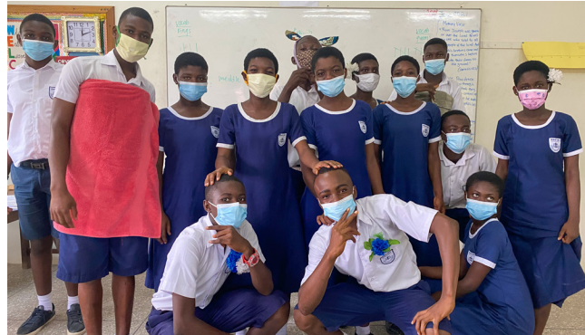
The grade eight class after we did a class performance of A Midsummer Night's Dream . Can you find the character who gets turned into a donkey?