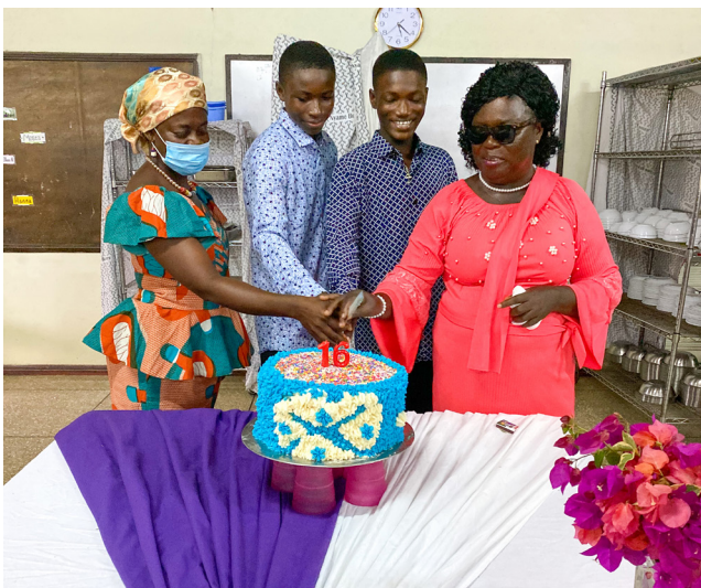
Two resident young men celebrating their birthdays.