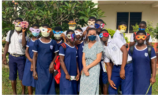
The grade eight class in the masks they made while reading Romeo and Juliet .