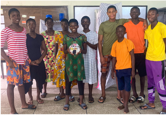
Resident students with the soccer ball they made out of recycled materials.