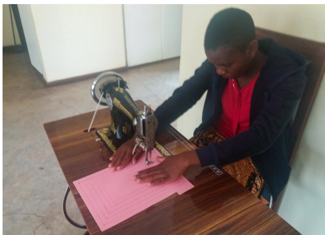
Beginning tailoring lessons