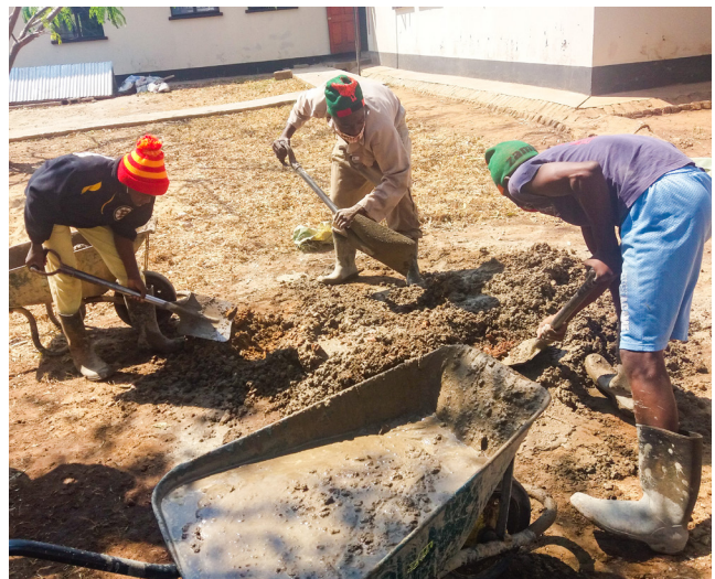
Tenth graders making cement for the sidewalk

Waiting during uncertainty. Zambia re-opened schools in July but only for examination classes (Grades 7, 9, 12). For our students who are in the other grades, the teachers create—and later correct—weekly packets of work to help the students stay caught up. For the resident non-examination children, this is also a time for them to develop other skills. In my June newsletter, I shared how the high school boys were learning basic construction skills while helping build a chicken house. Other boys have been learning how to make sidewalks, and the older girls are learning basic sewing and tailoring skills. Some of the high school residents also meet daily with the younger children for literature groups and math circles.