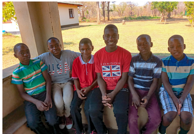
Resident boys waiting at their gazebo to walk to church Sunday morning

homes for over 800 orphans in the ten Rafiki Villages. I am especially thankful for the sponsors of these children. Because of their generosity, these children have had loving homes, healthy meals, and good education. Would you consider helping one of these resident orphans? Find out more at https://rafikifoundation.org .