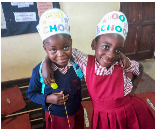
Day students celebrating 100 days of kindergarten

T is for transition. I am thankful to see God’s faithfulness during this time of transitioning from the Rafiki Schools being primarily for resident orphans to being primarily for day scholars. I am especially thankful for all who sponsor one of the day students. The quality of education we offer is outstanding, and expensive. It is sadly beyond the means of most families here, especially the ones nearest us, many of whom are subsistence farmers. Would you consider helping one of the day students continue to be able to partake of this outstanding education? Find out more at https://rafikifoundation.org .