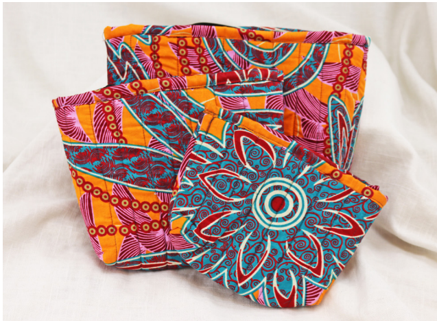
Some widows products at the Rafiki Exchange

New opportunities for teacher training. I am thankful that the Rafiki Institute of Classical Education (RICE) provides opportunities to prepare teachers to teach in classical Christian schools. These future teachers learn much about the Bible, teaching practices, literature, art, music, and history. They have practicum in our Rafiki Schools during each of the three years they are in school. I am also thankful for the assistance they give to our students and teachers as they complete their practica. Would you consider helping this program grow by praying that God will open opportunities for more classical Christian schools to begin, to use our curriculum, and to employ these well-prepared teachers?