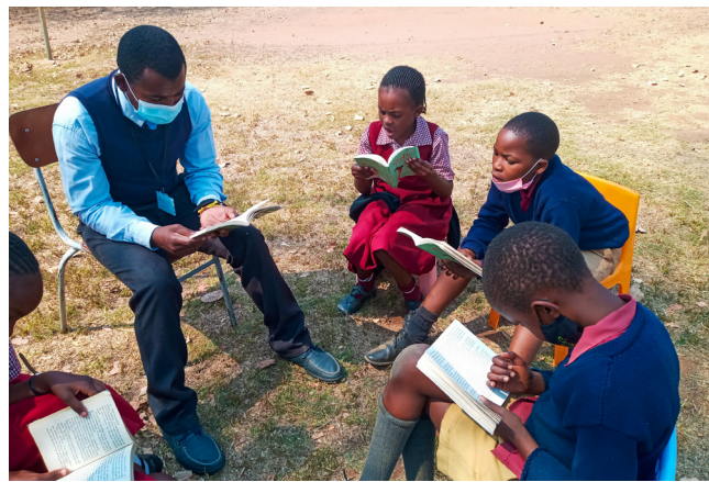
RICE practicum student with third grade reading group

New opportunities for teacher training. I am thankful that the Rafiki Institute of Classical Education (RICE) provides opportunities to prepare teachers to teach in classical Christian schools. These future teachers learn much about the Bible, teaching practices, literature, art, music, and history. They have practicum in our Rafiki Schools during each of the three years they are in school. I am also thankful for the assistance they give to our students and teachers as they complete their practica. Would you consider helping this program grow by praying that God will open opportunities for more classical Christian schools to begin, to use our curriculum, and to employ these well-prepared teachers?