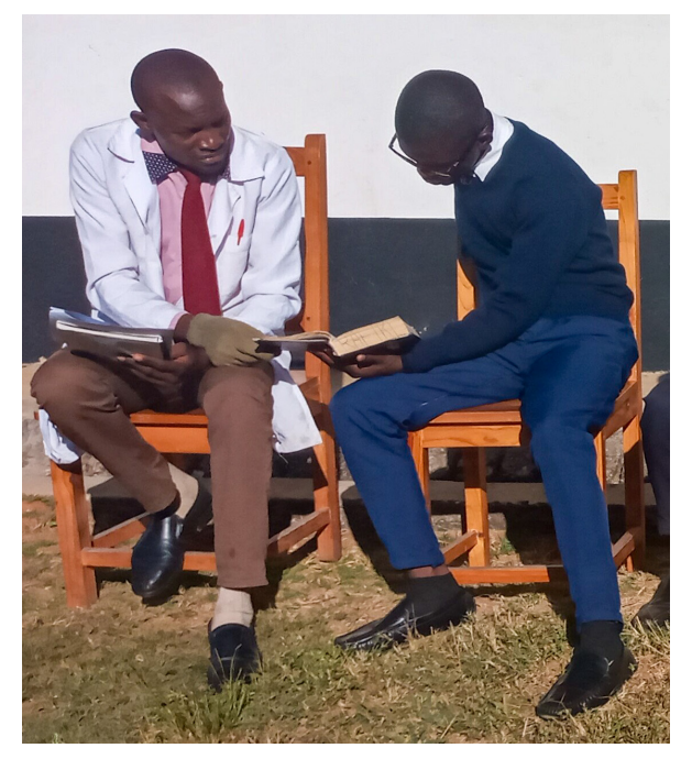
Grade 11 Bible teacher and student during morning Bible lesson (outside in the warm sun)