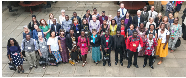
Rafiki staff from all 10 countries and Home Office at the classical Christian conference in Kenya

Please pray that this conference is a turning point for education in several countries in Africa.