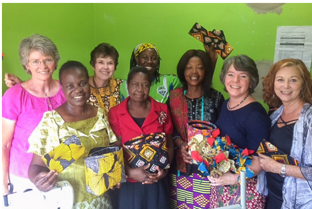
Widows showing their products to the Rafiki Zambia Village Administrator and Home Office Staff

Highlight #1: The Rafiki Widows Program in Zambia was jump-started! As you know, Rafiki works with widows in partner churches in all ten countries by selling their hand-made craft items at the Rafiki Exchange in Florida or online at rafikifoundation.org . By purchasing their items, you are helping these women support themselves and their children. The widows in Zambia are making beautiful cloth items like Christmas ornaments, luggage tags, and cosmetic bags. If you are looking for unique and meaningful gifts for Christmas, check out the widows’ products, you will find something for everyone on your list!