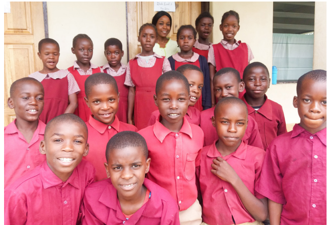
RICE graduate now Third Grade Teacher (look closely—she is behind her students!)

Highlight #2: First RICE graduation! The Rafiki Institute of Classical Christian Education (RICE), Rafiki’s teachers college, had its first graduation in September this year. It was held in conjunction with our partner church university, Justo Mwale University, and it was a day of great celebration as the RICE graduates in their caps and gowns received their diplomas. Our primary school has hired three of these graduates and we are extremely pleased to have them on our faculty.